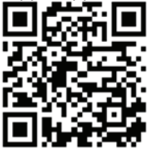
Apple App Store